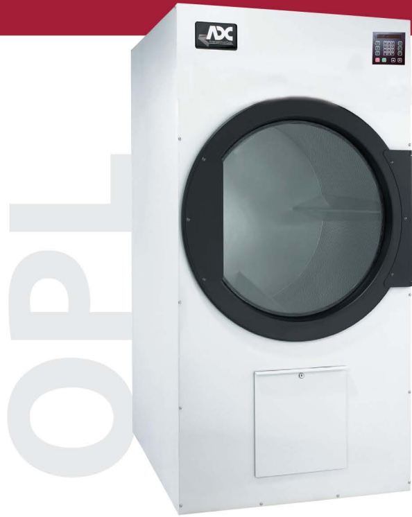
AD-758V OPL Dryer